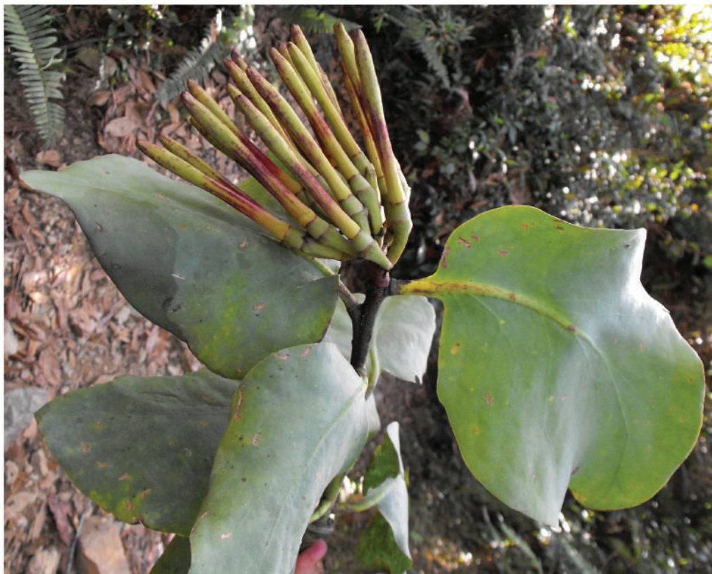
Figure 2. Psittacanthus longirectus Roldán & Alzate. Plant specimen (from Urrao, Antioquia, Colombia), showing the erect habit, the large and erect leaves, and reddish-green flowers