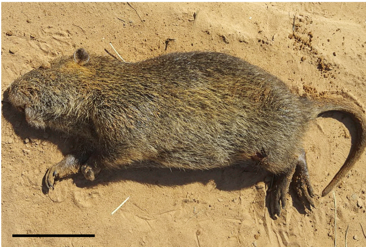
Figure 1. Myocastor coypus record being run-over and dead on a side road near wetlands and a dam, in a rural area in the municipality of Bataguassu (21° 44' 28.46" S; 52° 20' 8" W), east of the State of Mato Grosso do Sul, Brazil (10 cm bar).

It is not possible to state the origin of M. coypus reported in the present study, whether it was introduced or dispersed naturally in the swampy areas of the Paraná River, since the species has records on the border with the states of Mato Grosso do Sul and Paraná, where it is considered native, about 150 km from the record site (Aguiar et al., 2007). However, the record of an adult specimen may indicate the presence of other individual in the area and, considering the life cycle where sexual maturity varies between 3-10 months with a gestation of 127-138 days and with litters that vary of 5-13 pups (Oliveira and Bonvicino, 2006; Woods et al., 1992), has a great potential of becoming an invasive species in the state. It is necessary to implement monitoring programs to determine whether the species is present in the area,