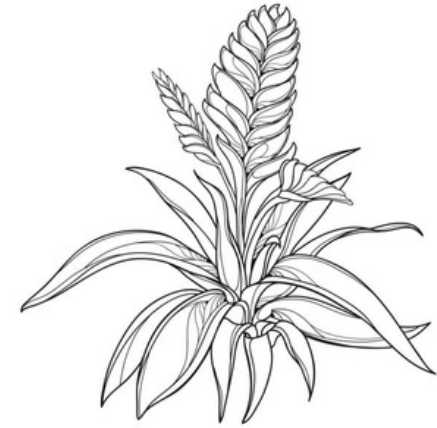
3 species of bromeliads ( Billbergia cf. vittata , Vriesea medusa , and Vriesea sp.)

Probable benefits for cockroaches: exploit the organic detritus accumulated in the bromeliad phytotelmata; protection from direct radiation and increased humidity; and reproductive sites.