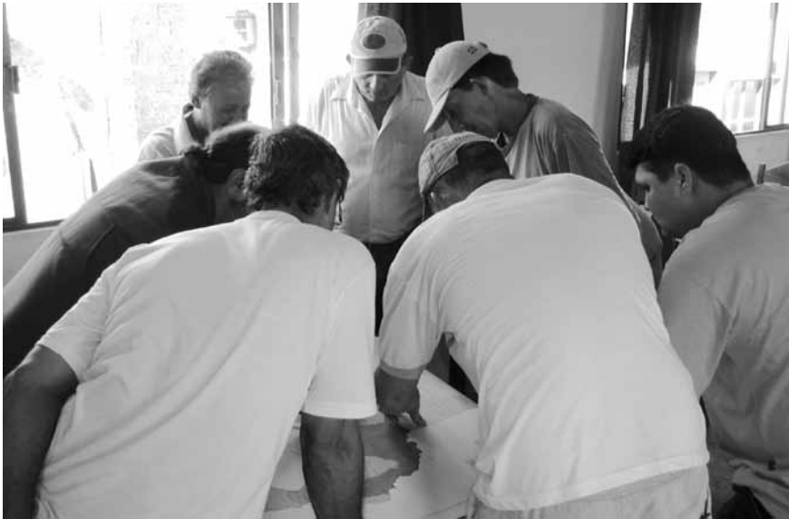
Figure 4. Castelenses participating in development workshops, March 2007

this story, but within the micropolitics of land tenure, and the forms of relation and corruption that hold together the social practice of grilagem , subject-positions relate differently to the narrative of collective abandonment. In the examples of Bigode and Claudio above, both privately admit to the less sanguine activities they have been involved with over the years in Castelo, and each continues to pursue these activities in a speculative spirit. What to the outside seems like generic abject lack becomes more clearly a field in which difference and alliance are negotiated when viewed up close: the stuck road dweller is one kind of prophylactic tactic that fits within a larger historical structure of gambling with development (vide figure 4).