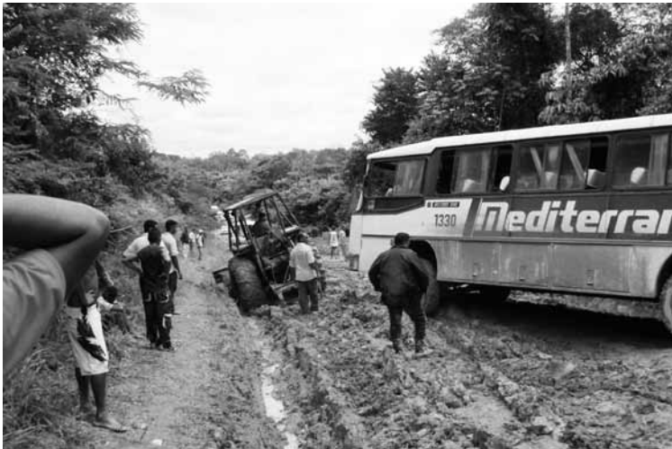
Figure 2. Stuck in the Mud, outside Castelo de Sonhos (February 2008)

Following mobilities within development encounters offers two key insights into social relations along the Br-163. First, as I traveled to and from dozens of public meetings along the road in 2006-07, it became clear that the “development state” that appeared so inert in documents and policy papers is stitched together in social practice. Engaged and knowledgeable bureaucrats were neither out-of-touch nor unsympathetic to roadside peoples as they came to know them through their travels (see Mathews, 2011). Nor were state representatives naïve to the range of licit and illicit activities that supposedly “stuck” villagers were pursuing. NGO activists and low-level officials were often critically self-aware of the limits of dialogue, the relative “thinness” of state promises, and the logistical challenges to implementing policy, no matter how well-conceived (Mosse, 2005) (vide figure 2).