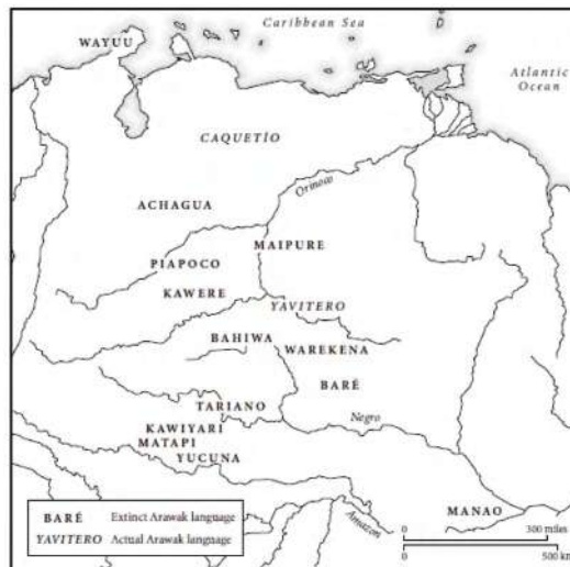
Figure 1 Arawak languages

Although I will be discussing primarily the Baniwa of the Içana and Aiary in this study, I will make ethnological comparisons with northern Arawak-speaking peoples along the Orinoco and its tributaries up to the Cassiquiare; along the upper Amazon, Japurá, Uaupés, and the Rio Negro from the mouth to the headwaters.