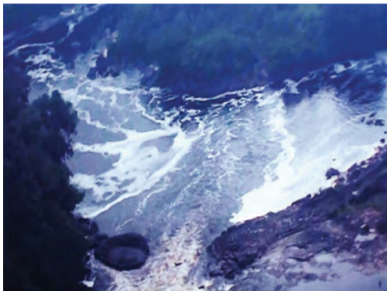
Figure 2 The sacred waterfalls of Hipana , birthplace of humanity at the holes in the center of the rapids; the first earth is the boulder on lower left

Hipana is considered the ‘center of the universe’ ( Hekwapi pamudzua ) in both a vertical and a horizontal sense. Vertically, it is situated between the upper world of the great spirits and Creator, and the lower world of the bones of the deceased along with a variety of spirit-entities (see Wright, 2013); horizontally, it is from this center place that “This World” grew outwards to its geographical limits, to “where the earth meets the sky” ( eenu táhe ).