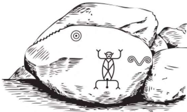
Figure 4 Petroglyph of Kuwai-ka-Wamundana