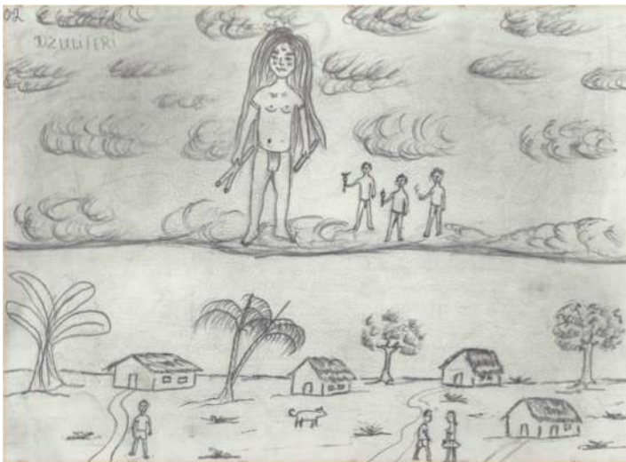
Figure 7 Dzuliferi watches over and protects people in their villages of this world

Kuwai and Dzuliferi ( Nhiaperikuli 's elder brother and co-creator) are two distinct spirit entities, though they are socially related as uncle ( Dzuliferi ) and nephew ( Kuwai ), parallel in a fashion to the relation of Amaru and Nhiaperikuli (‘aunt’ and ‘nephew’). The shaman-uncle Dzuliferi cannot transform into the sorcerer-nephew Kuwai , although Kuwai can transform into the “shadow-soul of Dzuliferi ” meaning that he can appear to be Dzuliferi , but is actually Kuwai impersonating Dzuliferi in order to teach apprentice Pajés how to extract sickness. Ultimately, apprentices learn how to cure from the very source of the poison or sickness that afflicted the ill.