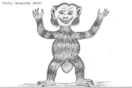
Figure 6 Kuwai-ka-Wamundana , the Spirit Owner of Sickness