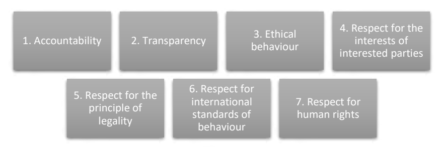
Figure III. Principles of CSR

• Respect for human rights: it establishes the importance of respecting human rights and recognizing both their importance and their universality.