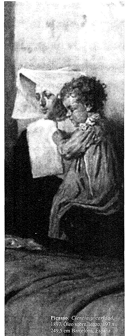
Picasso. Ciencia y caridad . 1897. Óleo sobre lienzo, 197 x 249,5 cm Barcelona, España.

Using an interpreter is never as good as communicating directly. However, there are problems related to using family members as interpreters. They often don't have medical terminology or adequate English skills, or maybe only a child speaks Swedish. Children or spouses of immigrants are extremely protective of the pride of their family member and try to avoid embarrassment at all costs, including hiding important medical information. One of my Afghan friends described how horrified and embarrassed she was when her gynecologist asked her 12 year old son to interpret about his mother's problem. In male-dominated cultures, it may be a major assault to the father's self-esteem if he must depend on a child or wife for translation on a regular basis.