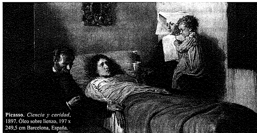
Picasso. Ciencia y caridad , 1897. Óleo sobre lienzo, 197 x 249,5 cm Barcelona, España.

2. Eye contact varies from intense to fleeting. You may feel that Arabs are looking straight through you, which is uncomfortable when you also feel that they are standing on your face. At the other extreme are American Indians who