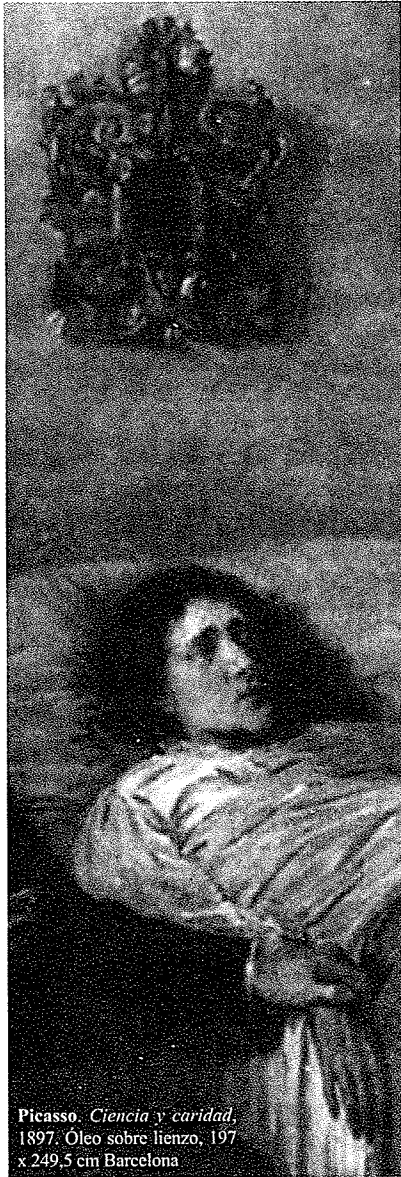
Picasso. Ciencia y caridad , 1897. Óleo sobre lienzo, 197 x 249,5 cm Barcelona

We improve our cultural perspective both intellectually and through personal experience. You cannot know what it is really like to be a refugee only through reading, although some novels do a pretty good job. The most effective way to understand the magnitude of cultural differences is through experiencing them first-hand, by being a "foreigner," or by having close friends from other cultures. This personal experience makes us confront rather than deny cultural differences.