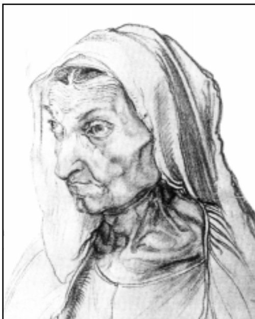
Alberto Durero La madre de Durero, Barbara Holper, sin fecha. Carboncillo sobre papel, 42,1 x 30,3 cm. Berlin, Staatliche Museen zu Berlin - Preußischer Kulturbesitz, Kupferstichkabinett.

This instrument, allowed us to know the index of deterioration of the quality of the patients' life with ND in each one of these areas. The profile of the quality of life, shows the aspects that are being affected in each area of the suffering