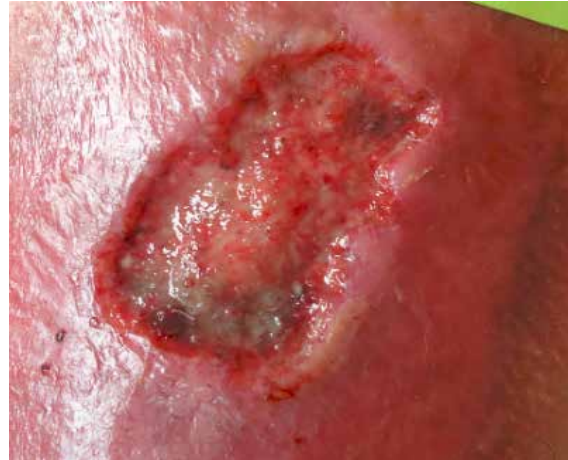
Figure 1. Photo of the first and last day of the coverage application of BC/Ibu