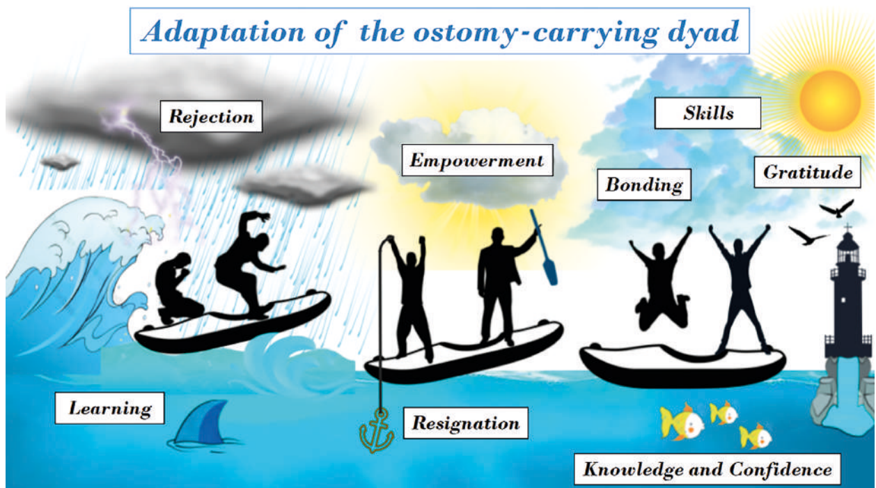
Figure 3. Scheme of the meta-theme.