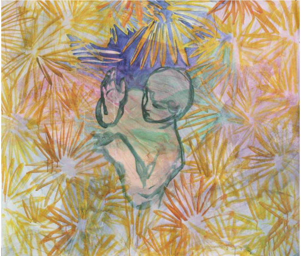
Selva I, 1989 Acrílico sobre papel, 140 x 163 cm