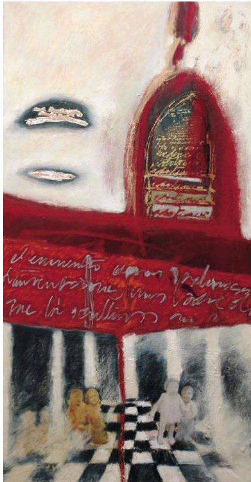
Palimpsesto, 2004. Collage sobre lienzo, 200 x 100 cm