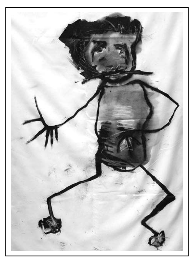
SIN TÍTULO, 2003 Acrílico sobre papel, 95 x 70 cm.