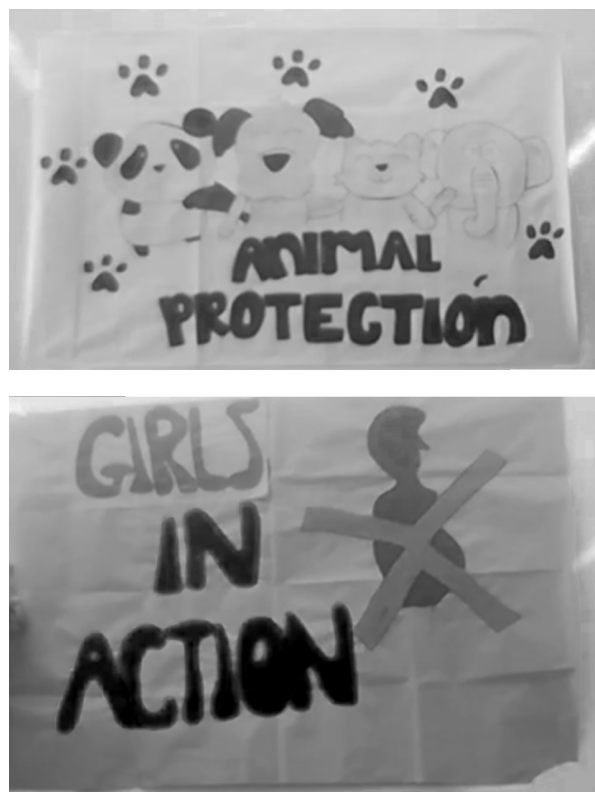
Figure 3 Two Student Organization Posters Created to Support the Community

correction in grammar and punctuation. Students did a series of in-class presentations with posters (see Figure 3) to practice speaking the language in front of their peers and get feedback. Some of the groups actually went into their neighborhoods and raised money to provide food to homeless people and buy food for dogs. Others went around the school and created awareness about drug addiction and teenage pregnancy.