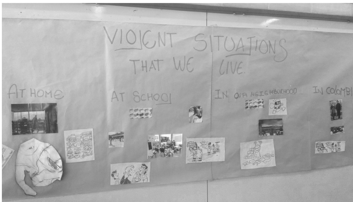
Figure 4 Student Representations of Violent Situations