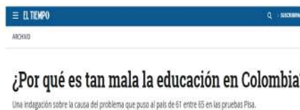
Figure 2 News headline from El Tiempo Note: The headline “Por qué es tan mala la educación en Colombia” can be roughly translated to “Why education is so poor in Colombia” (Gossain, 2014, February 27).