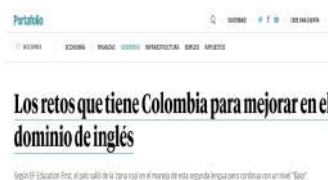
Figure 4 News headline from Portafolio Note: The headline “Los retos que tiene Colombia para mejorar el dominio del inglés” can be roughly translated to “The challenges of Colombia to improve proficiency in English.”

inations or in a ranking of countries by English skills conducted by English First (EF) 2 (see Figures 1 to 4), media reports tended to portray teachers as the primary cause of the supposed or assumed failure.