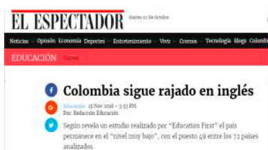
Figure 3 News headline from El Espectador Note: The headline “Colombia sigue rajado en inglés” can be roughly translated to “Colombia still Flunking English” (El Espectador, 2016, November 15).