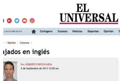
Figure 1 News headline from El Universal Note: The headline “Rajados en inglés” can be roughly translated to “Flunking English” (Fortich Mesa, 2013, September 6).