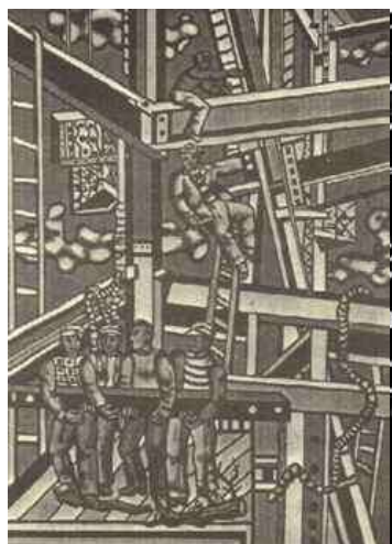
Les constructeurs (1950) Fernand Léger

The Practicum I: Classroom Observation seminar sessions was also the setting where trainees were given input on topics Cristina felt had not been developed fully in previous courses, such as planning lessons and units, and designing tasks. We used Doff (1988) and Gower and Walters