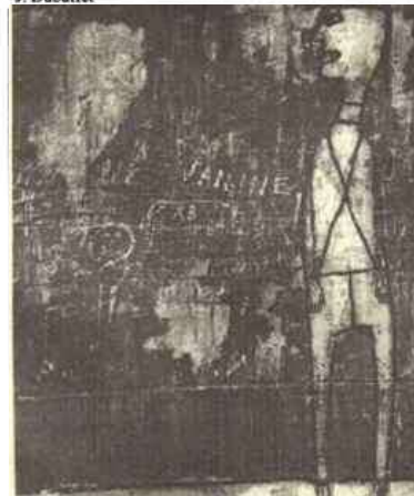
Mur avec inscriptions (1945) J. Dubuffet