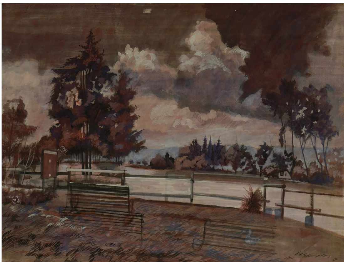
"Parque El Lago", 2016, temple on panel, 25 x 35 cm