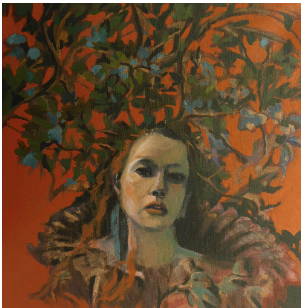
"Espíritu anarquista", 2018, oil on canvas, 40 x 35 cm