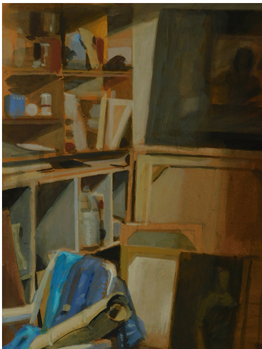
"El taller del Artista", 2019, temple on panel, 25 x 35 cm.