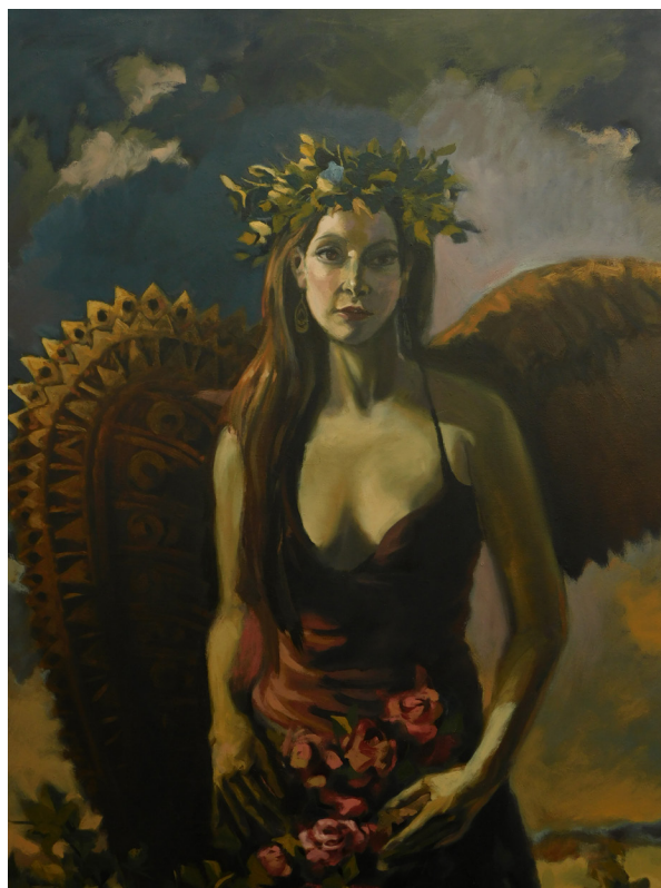
"Lilith", 2018, oil on canvas, 70 x 100 cm