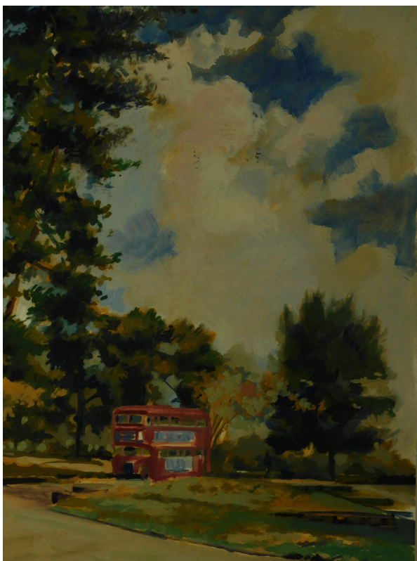
"Parque El Chicó", 2012, oil on paper, 25 x 35 cm