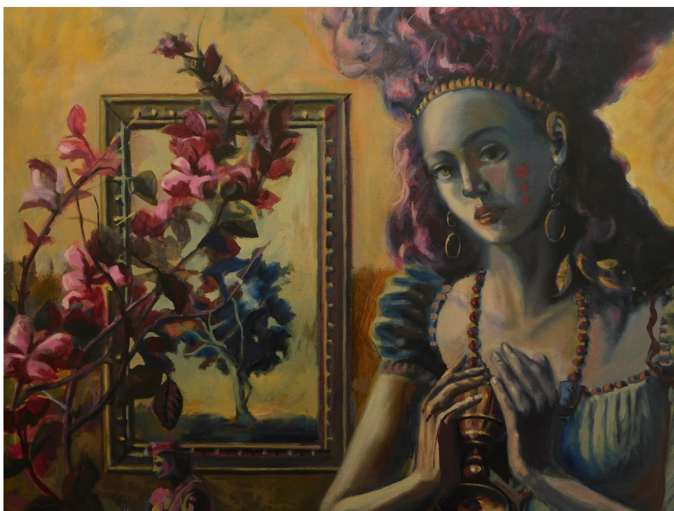
"El cáliz de la vida", 2015, oil on canvas, 50 x70 cm