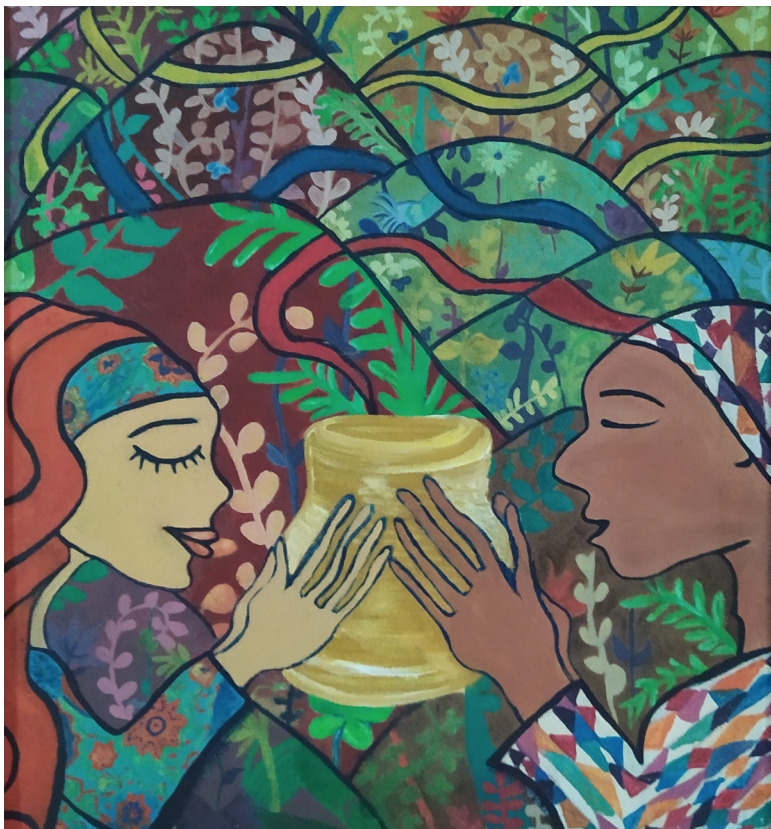
Sincronicidad, 2008, Oil on canvas