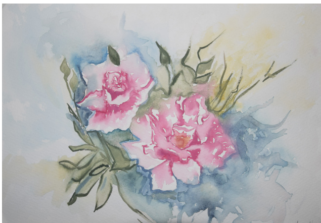
El rosal, 2018, Watercolor