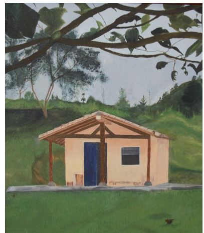
La casita, 2007, Oil on canvas