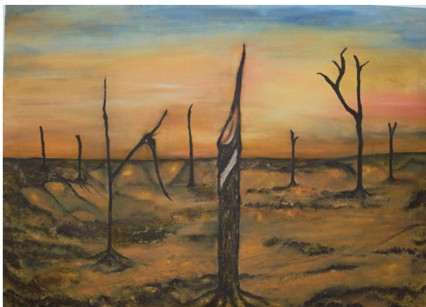
Sin tierra, 2016, Oil on canvas