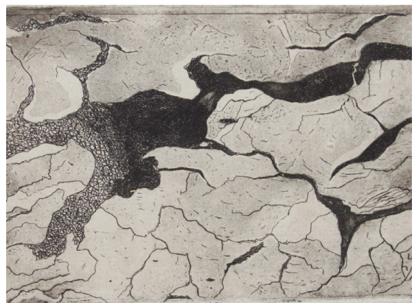
Terredad, 2017, Engravin on artisanal paper