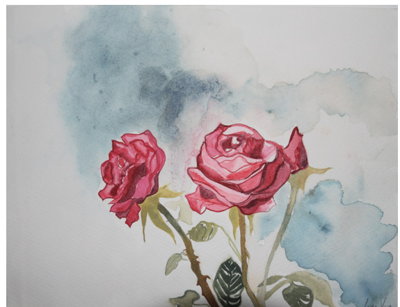
El rosal, 2018, Watercolor