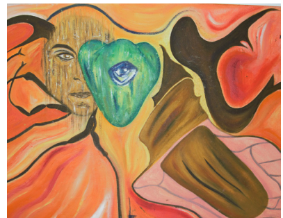
Autorretrato, 2016, Oil on canvas