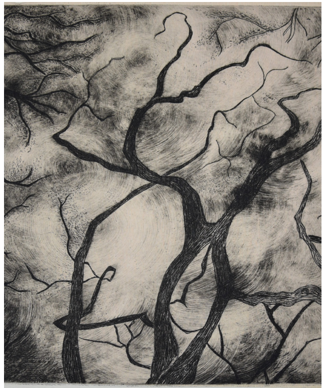
Serenidad, 2017, Engraving