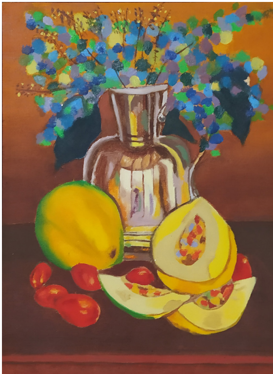
Bodegón, 2001, Oil on canvas