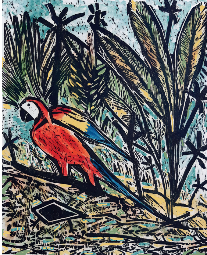
Exótico, 2020, Woodcut