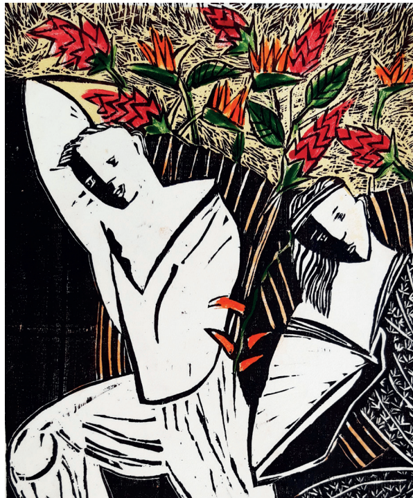
Silleteros, 2003, Wood engraving