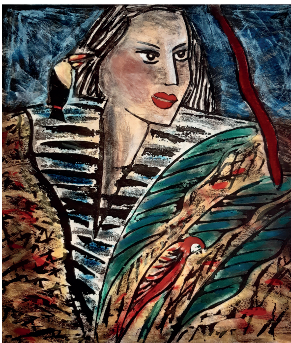
Tucán, 2003, Etching