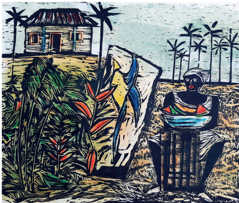
Zapuzro, 2018, Woodcut