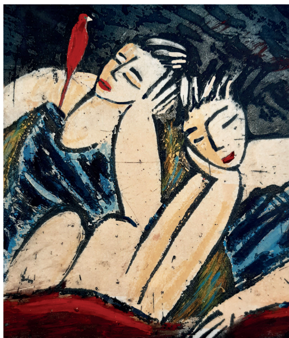
Dreams, 2017, Etching