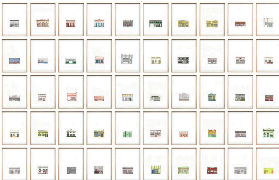
Title: Archivo sensible de arquitectura bogotana en vía de extinción Technique: Watercolor on paper Dimensions: 18 x 13 cm 2015 - 2024