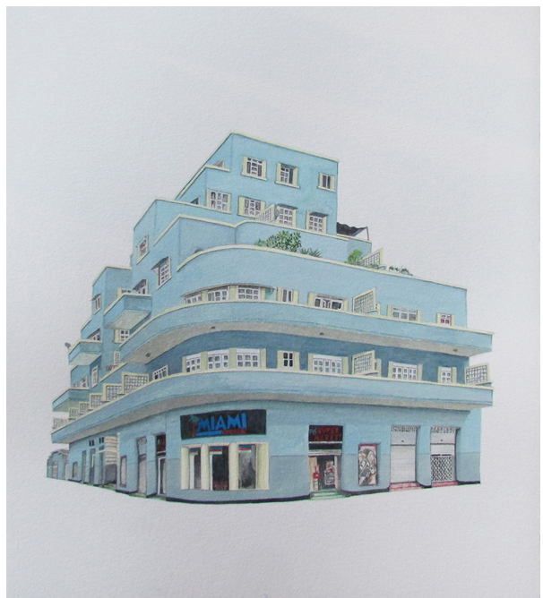
Title: Edificio García Barranquilla Technique: Watercolor on paper Dimensions: 70 x 50 cm 2018