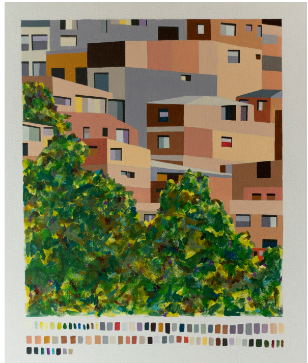
Title: Cerro del cable (series Lo humano de la montaña ) Technique: Acrylic on canvas Dimensions: 60 x 50 cm 2023