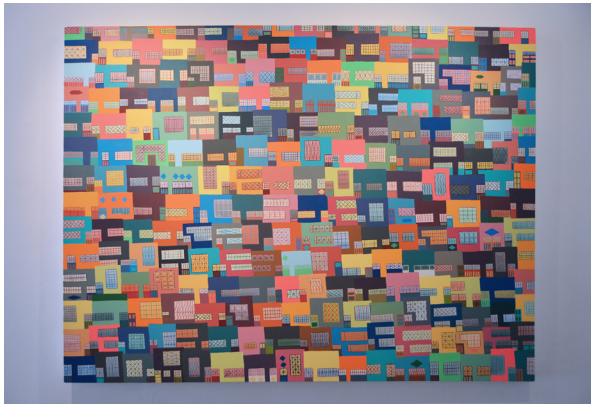
Title: Paisajes hechos a mano Technique: Acrylic on canvas Dimensions: 130 x 170 cm 2016