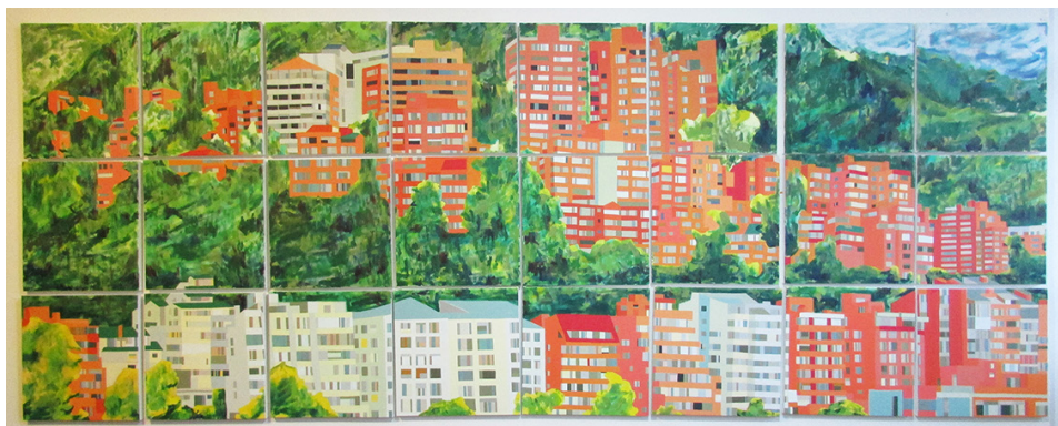
Title: La cabrera (series Lo humano de la montaña ) Technique: Acrylic on canvas Dimensions: 150 x 400 cm 2017