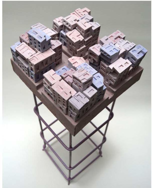
Title: Construcciones cromáticas Technique: Cement and dyed plaster, metallic rods painted with industrial enamel Dimensions: 85 x 28 x 28 cm 2014 - 2015