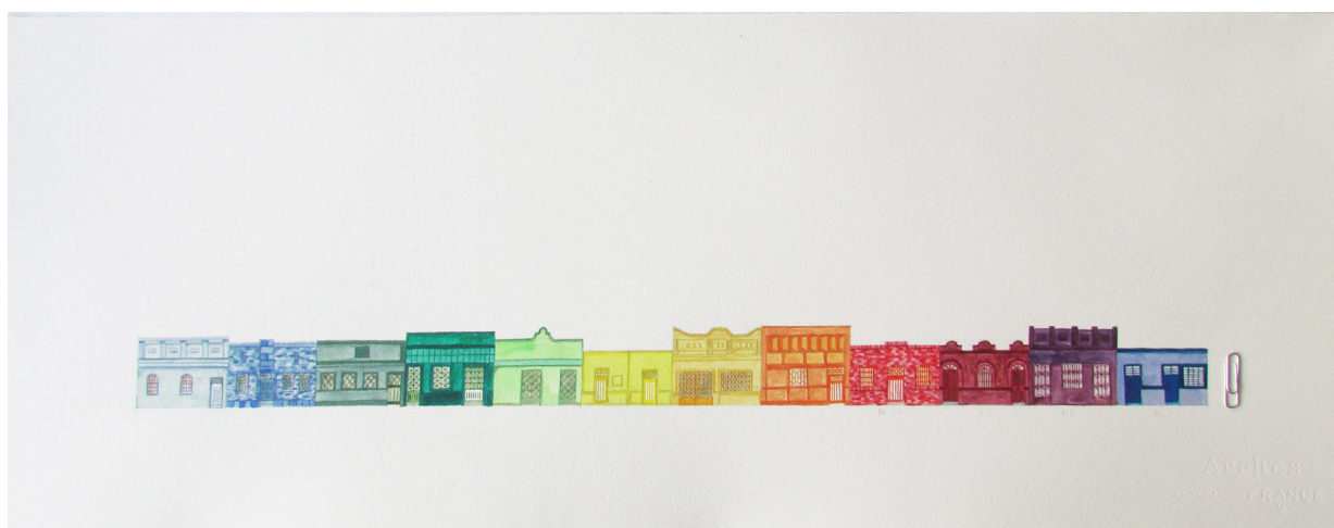
Title: Barrio 7 de agosto (series Archivo sensible de arquitectura bogotana en vía de extinción ) Technique: Watercolor on paper Dimensions: 25 x 70 cm 2016