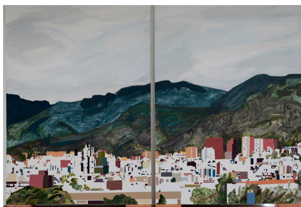
Title: Cerros orientales desde la Universidad Nacional de Colombia Technique: Poster paint and acrylic on canvas Dimensions: 170 x 220 cm 2024