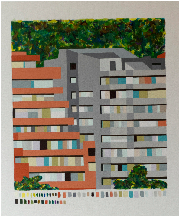
Title: Calle 85 (series Lo humano de la montaña ) Technique: Acrylic on canvas Dimensions: 60 x 50 cm 2023