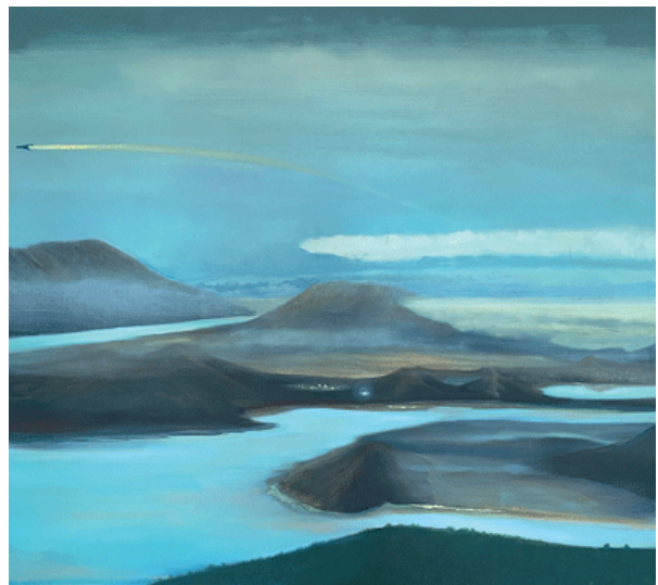
Title: Lo que el ojo no ve Technique: Oil on canvas Dimensions: 80 x 150 cm 2023