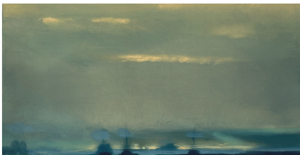
Title: Lo que el ojo no ve Technique: Oil on canvas Dimensions: 80 x 150 cm 2023