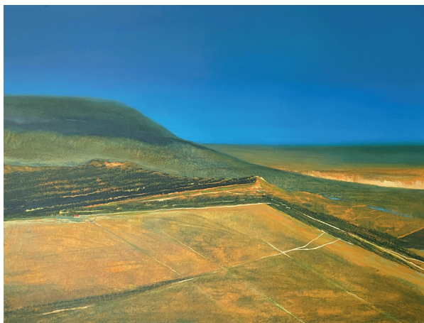
Title: Lo que el ojo no ve Technique: Oil on canvas Dimensions: 80 x 150 cm 2023