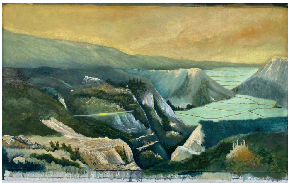
Title: Lo que el ojo no ve Technique: Oil on canvas Dimensions: 80 x 150 cm 2024