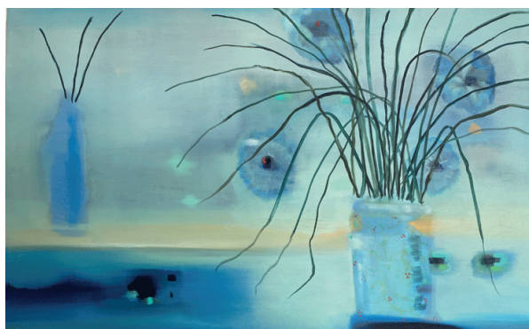
Title: Lo que el ojo no ve Technique: Oil on canvas Dimensions: 80 x 150 cm 2019