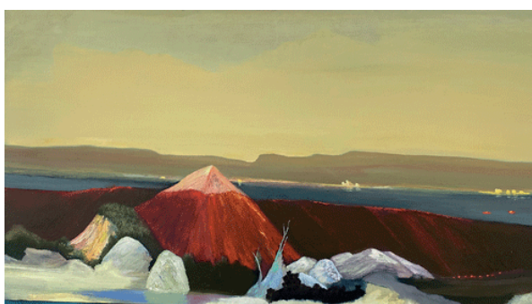
Title: Lo que el ojo no ve Technique: Oil on canvas Dimensions: 80 x 150 cm 2023