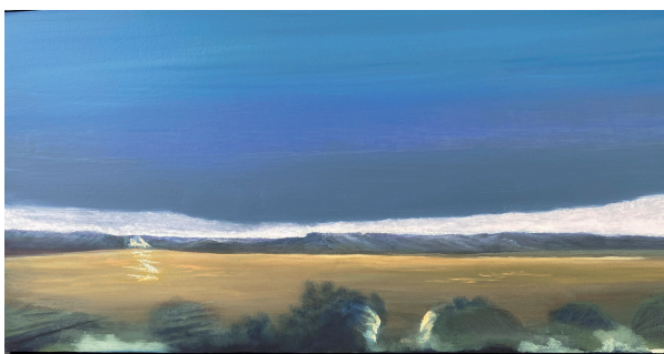
Title: Lo que el ojo no ve Technique: Oil on canvas Dimensions: 80 x 150 cm 2023