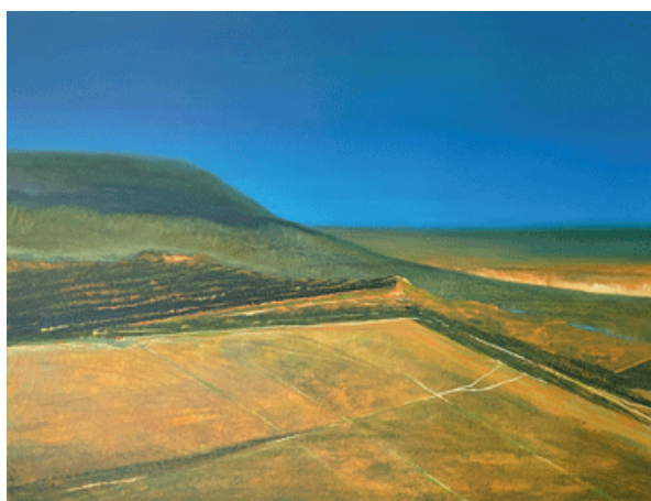
Title: Lo que el ojo no ve Technique: Oil on canvas Dimensions: 80 x 150 cm 2024