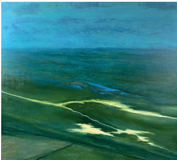
Title: Lo que el ojo no ve Technique: Oil on canvas Dimensions: 80 x 150 cm 2024