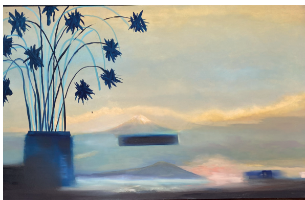
Title: Lo que el ojo no ve Technique: Oil on canvas Dimensions: 80 x 150 cm 2019