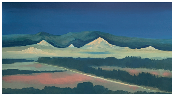
Title: Lo que el ojo no ve Technique: Oil on canvas Dimensions: 80 x 150 cm 2023