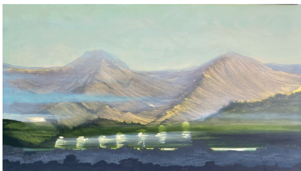
Title: Lo que el ojo no ve Technique: Oil on canvas Dimensions: 80 x 150 cm 2012