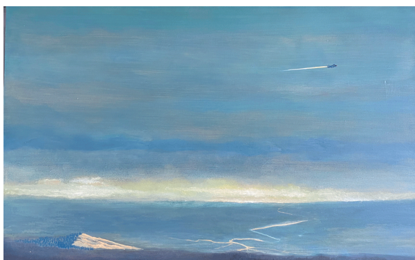
Title: Lo que el ojo no ve Technique: Oil on canvas Dimensions: 80 x 150 cm 2023