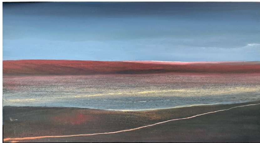
Title: Lo que el ojo no ve Technique: Oil on canvas Dimensions: 80 x 150 cm 2024