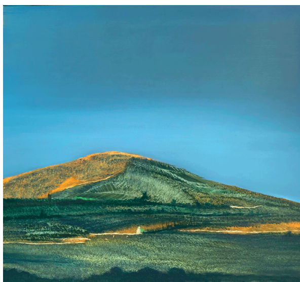
Title: Lo que el ojo no ve Technique: Oil on canvas Dimensions: 80 x 150 cm 2024