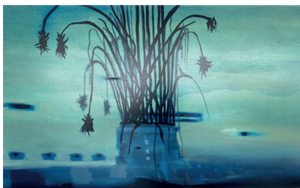
Title: Lo que el ojo no ve Technique: Oil on canvas Dimensions: 80 x 150 cm 2019