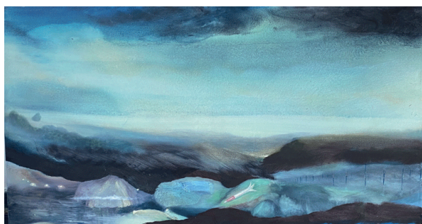
Title: Lo que el ojo no ve Technique: Oil on canvas Dimensions: 80 x 150 cm 2020