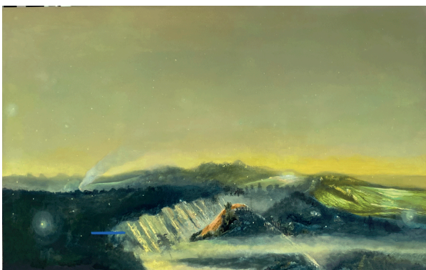
Title: Lo que el ojo no ve Technique: Oil on canvas Dimensions: 80 x 150 cm 2023