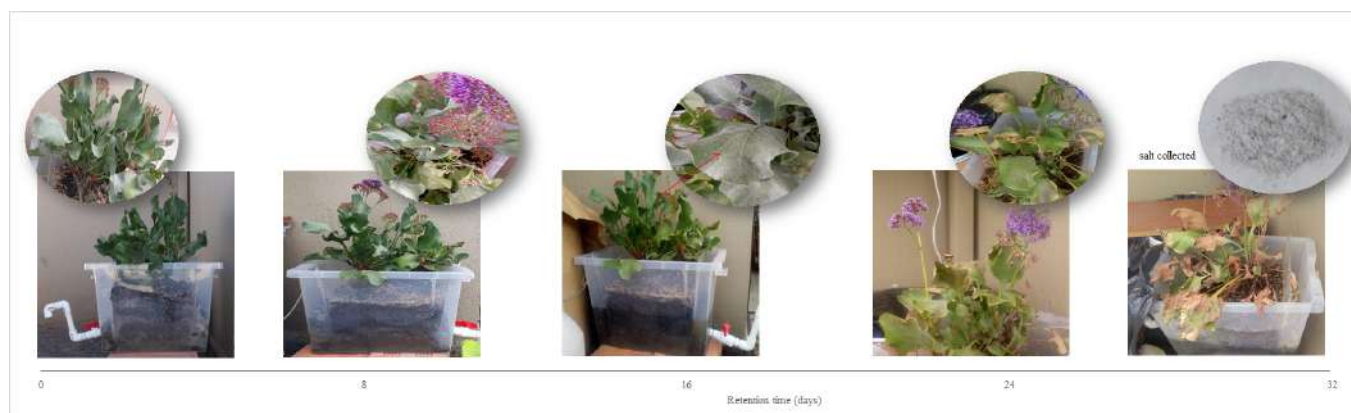
Figure 2 Photographic record of the plants during the start-up of the wetland