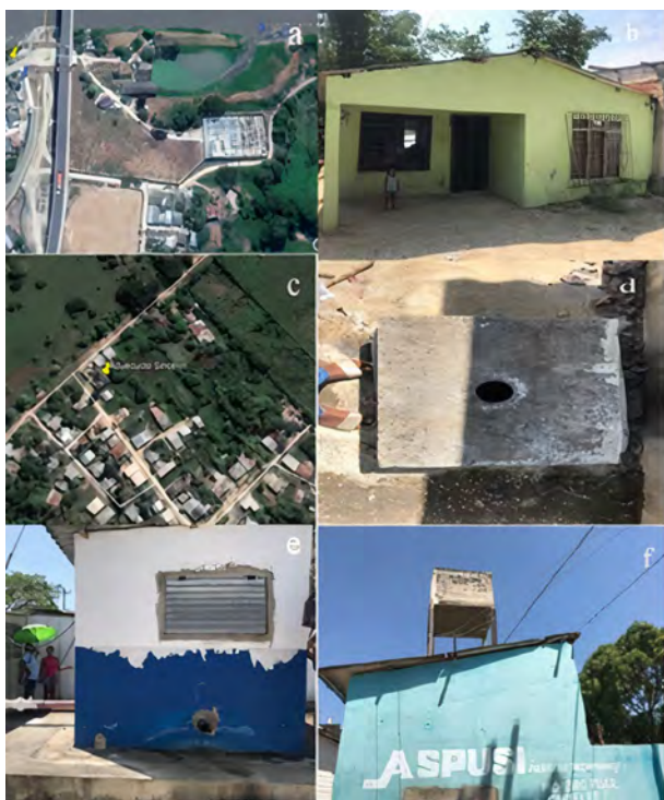
Figure 2 Sampling locations (a) Gambote’s raw water sampling point (GAMB); (b) House near the Canal del Dique after alum addition (GAMBT); (c) Sincerín’s well location; (d) Closeup of Sincerín’s Well; (e) Pipeline connected to Sincerín’s well where raw groundwater samples were collected (SINC); (f) Aqueduct offices (SINCT).