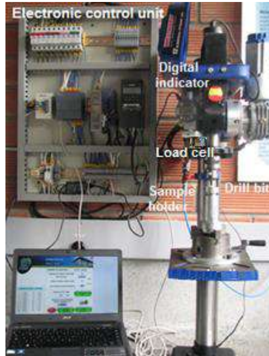
Figure 1. Instrumented bench drill.

On the other hand, the drilling tests were realized with a pyramidal tungsten carbide drill bit using the instrumented bench drill showed in Figure 1, which applied slowly an incremental force to a maximal load (approximately 100 N) and then the force was decreased to zero using a load and unload speed of 0.15 mm/s in order to obtain the hysteresis graphics (Force Vs Indentation Depth).