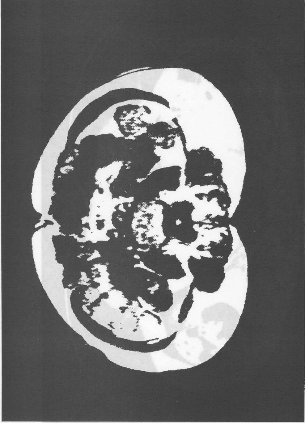
Figure 2 A magnetic resonance image (MRI) at the level of the umbilicus of a postmenopausal female