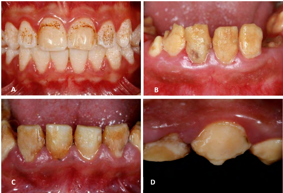
Figure 2. Variation of dental phenotype in amelogenesis imperfecta

(A) Hypoplastic AI: dental enamel with thin, yellow-brown ditches or depressions (B) Hypomaturational AI: dentine is soft and rough. It shows a mottling with snowflakes appearance. (C, D) hypocalcified AI: yellow-brown soft, friable dental enamel. Note the early enamel loss.