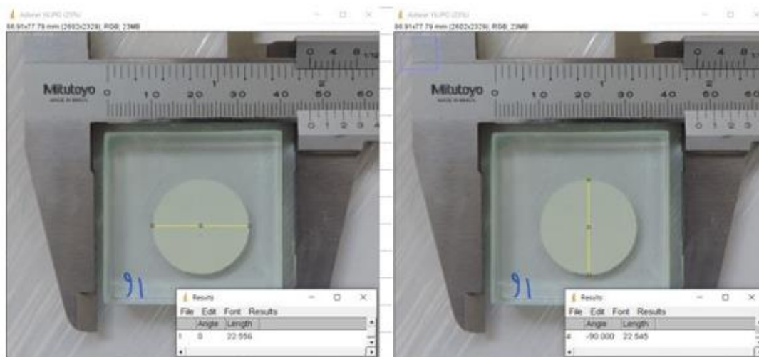
Figure 2. Diameter reached by the sealants