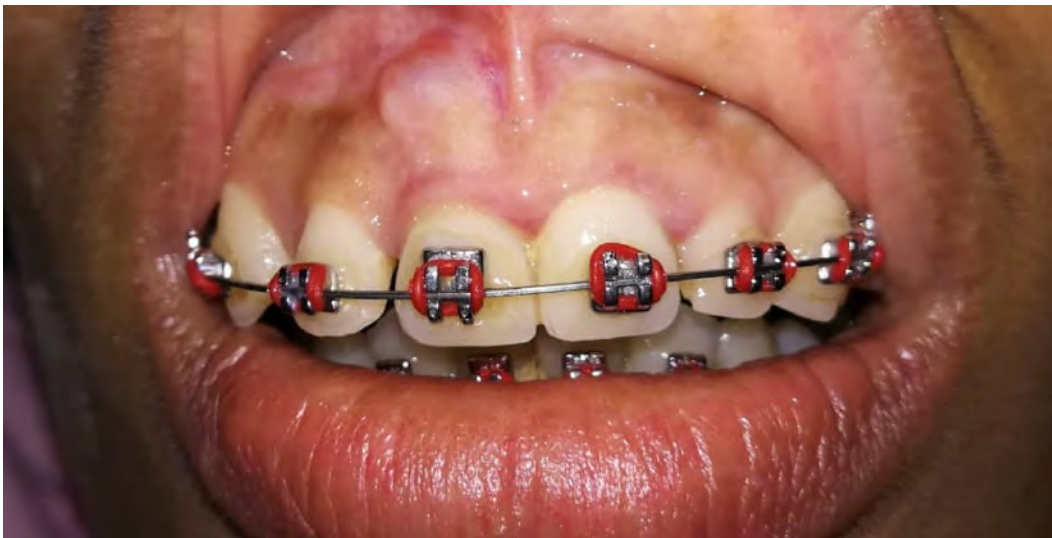
Figure 1. Clinical view of free gingiva lesion on top right quadrant

The intraoral examination showed a nodular lesion located at the level of free gingiva of the right upper central incisor, of the same color of adjacent mucosa with a violet central region, which was maintained despite the increase in size. The lesion was approximately 1 cm in diameter, asymptomatic to palpation, of fluctuating consistency, with liquid content, 4 months of evolution, and unknown etiology. Clinically, the lesion did not coincide with infectious processes, and the images showed no bone compromise. The patient had had bimaxillary orthodontic appliance for about 1 year, which was still active (Figure 1).