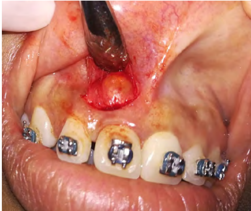
Figure 2. Lesion exposure

of vascular light and an infiltrate with significant infiltration of eosinophils. The definitive anatomopathological report was "angiolymphoid hyperplasia with eosinophilia".