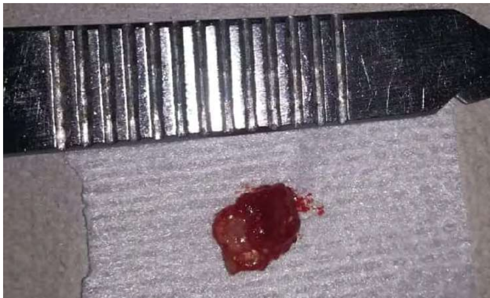
Figure 3. Macroscopic view of the resected specimen