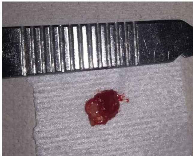
Figure 3. Macroscopic view of the resected specimen