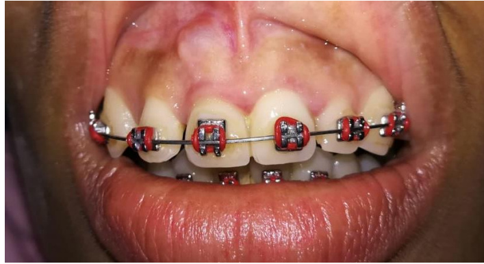
Figure 1. Clinical view of free gingiva lesion on top right quadrant