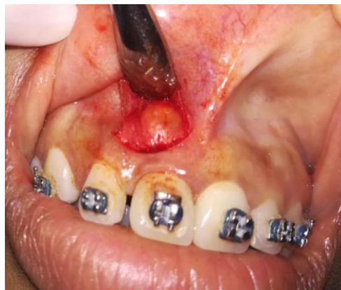
Figure 2. Lesion exposure