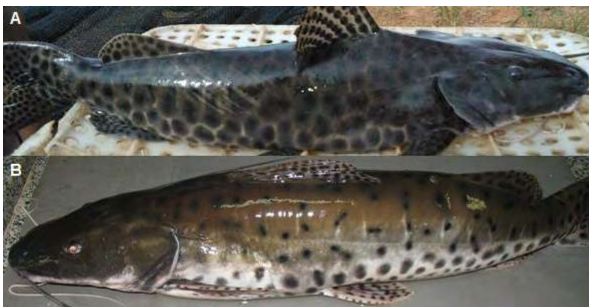
Figure 1. Amazon hybrid sorubim (A) and real hybrid sorubim (B).