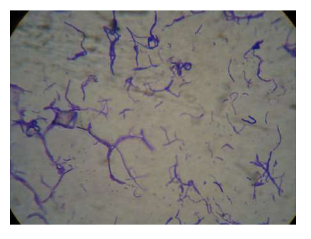
Figure 2. Colonies of Streptobacilli (1000X) grown on MRS agar.

At a magnification of 1000X, the image suggested that it would be the species Lactobacillus delbrueckii subsp. bulgaricus and Lactobacillus acidophilus , as these genera are gram-positive rods. The information provided by (19) stated that the probiotic microorganisms used include the genera mentioned above.