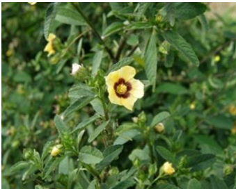
Sida rhombifolia L.